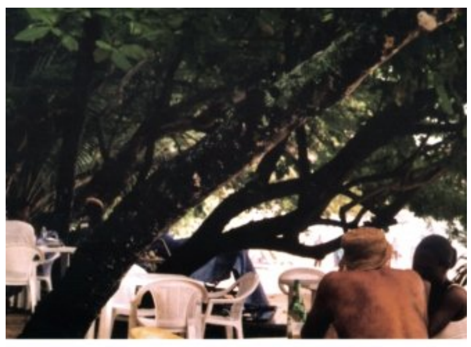
TRANSNATIONAL DESIRES AND SEX TOURISM IN THE DOMINICAN REPUBLIC